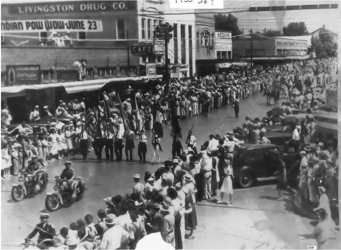
1938 Alabama-Coushatta 1 st Pow Wow parade