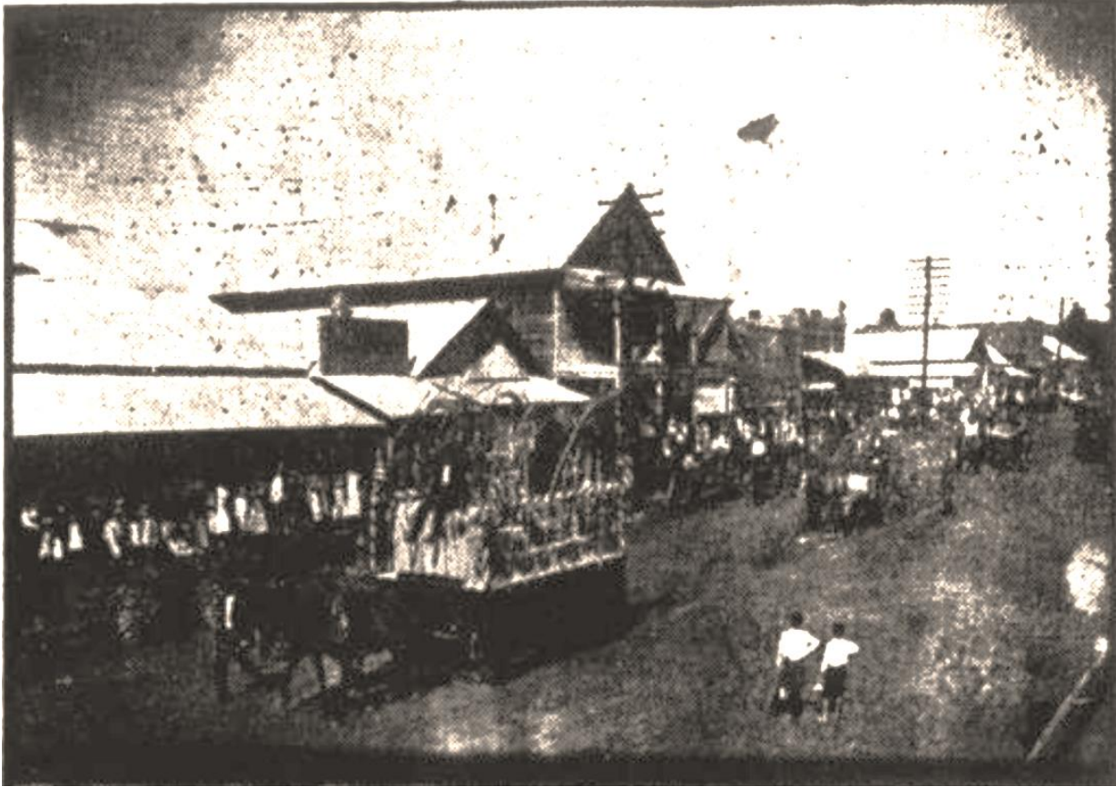
1911 County Fair parade, Liv Drug Company, two-story building in the center