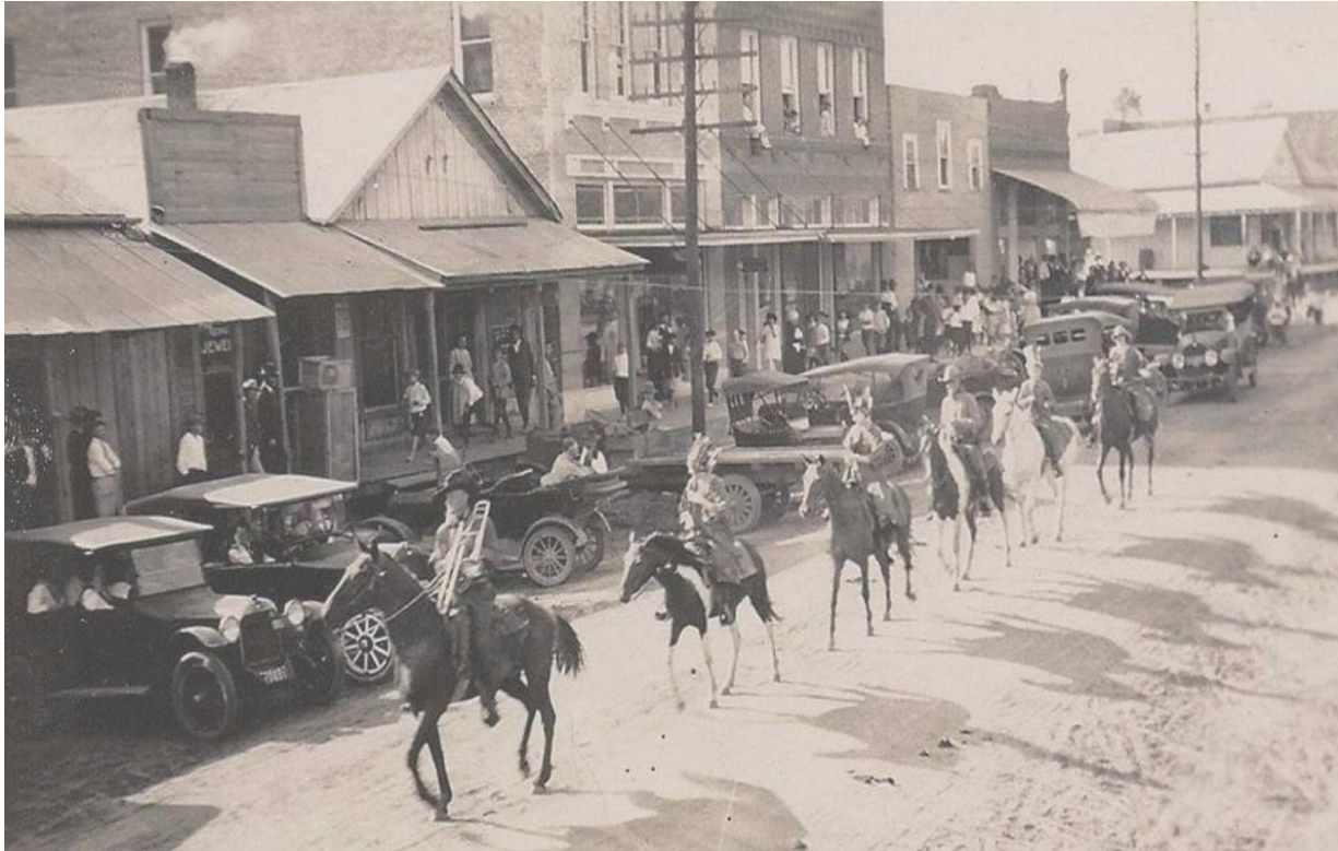
Parade photo, approximately 1918